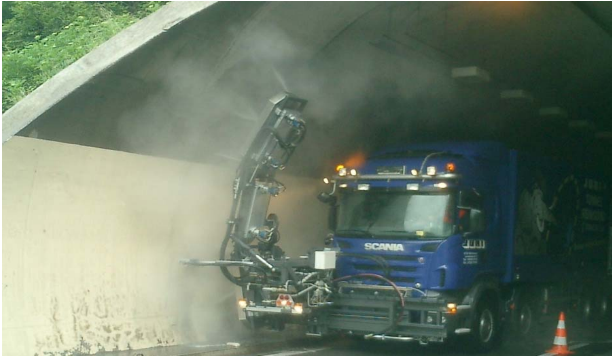
Photo above: The purpose-built vehicle TCT 400 H during operation. The nozzle arrangement at the front of the vehicle can be configured hydraulically to match the tunnel profile

All hydraulic circuits are supplied or driven by the vehicle engine.