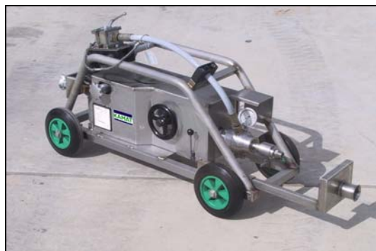
Part No. 7010382