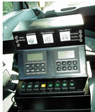
Additional control panel in driver's cab