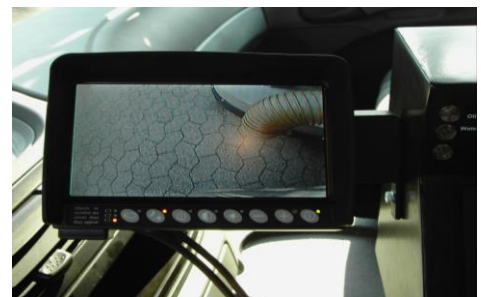
Monitor in the driver's cab for transfer of the cleaning results

The RWC 1000 HS is an ultra-modern vehicle which successfully removes automatically all types of rubber deposits from the touch-down zones of airport runways. The high pressure pump works at a pressure of 1000 to 2500 bar (stepless adjustment) and a flow rate of 29 l/min. While the cleaning job is being carried out, the dirty water and the removed debris is completely drawn off and removed by suction.