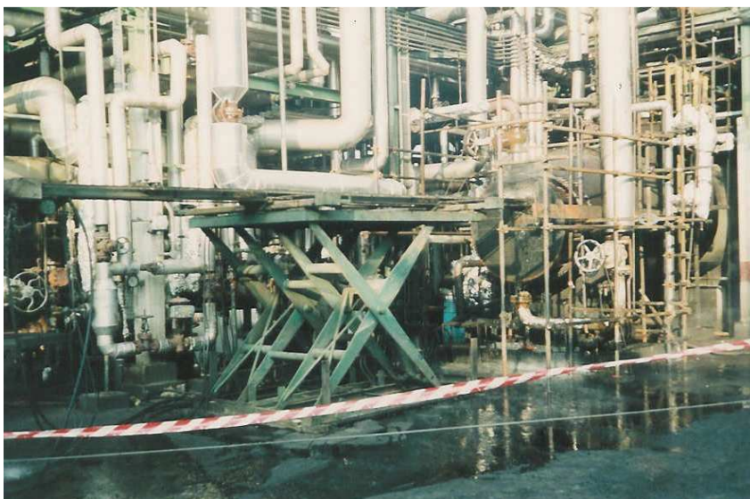
Scissor-type lifting table with lance unit for internal cleaning

The cleaning systems can be equipped with either 3, 4, 5 or 6 lances, to work simultaneously.